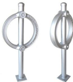
* Single/Bike Ring