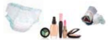
Diapers and personal hygiene products.