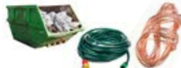
Scrap metal, wires and cables, home and construction waste.