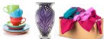
Textiles, housewares, windows, ceramics, and other reusable items.