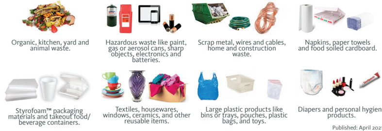
Organic, kitchen, yard and animal waste.