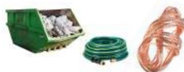
Scrap metal, wires and cables, home and construction waste.