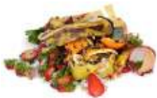
Organic, kitchen, yard and animal waste.