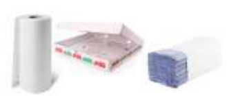
Napkins, paper towels and food soiled cardboard.