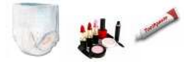
Diapers and personal hygiene products.