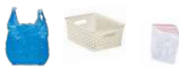
Large plastic products like bins or trays, pouches, plastic bags, and toys.