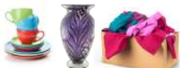
Textiles, housewares, windows, ceramics, and other reusable items.